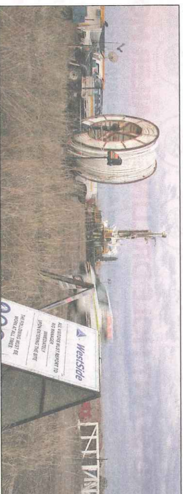
Schramm drilling rig at WestSide Meridian SeamGas's Pretty Plains field